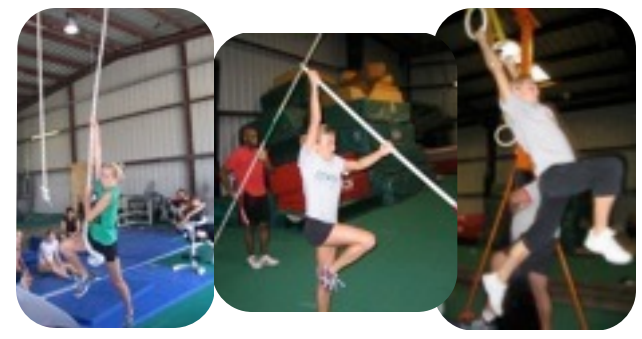
We are located off of I-35W in Haslet, Texas. Just West of I-35W between and Golden Triangle Blvd. and Heritage Trace Pkwy.